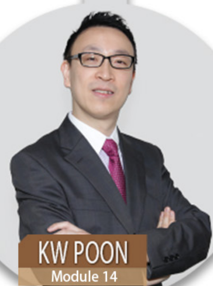
KW POON Module 14