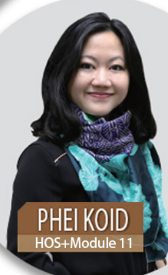
PHEI KOID HOS+Module 11