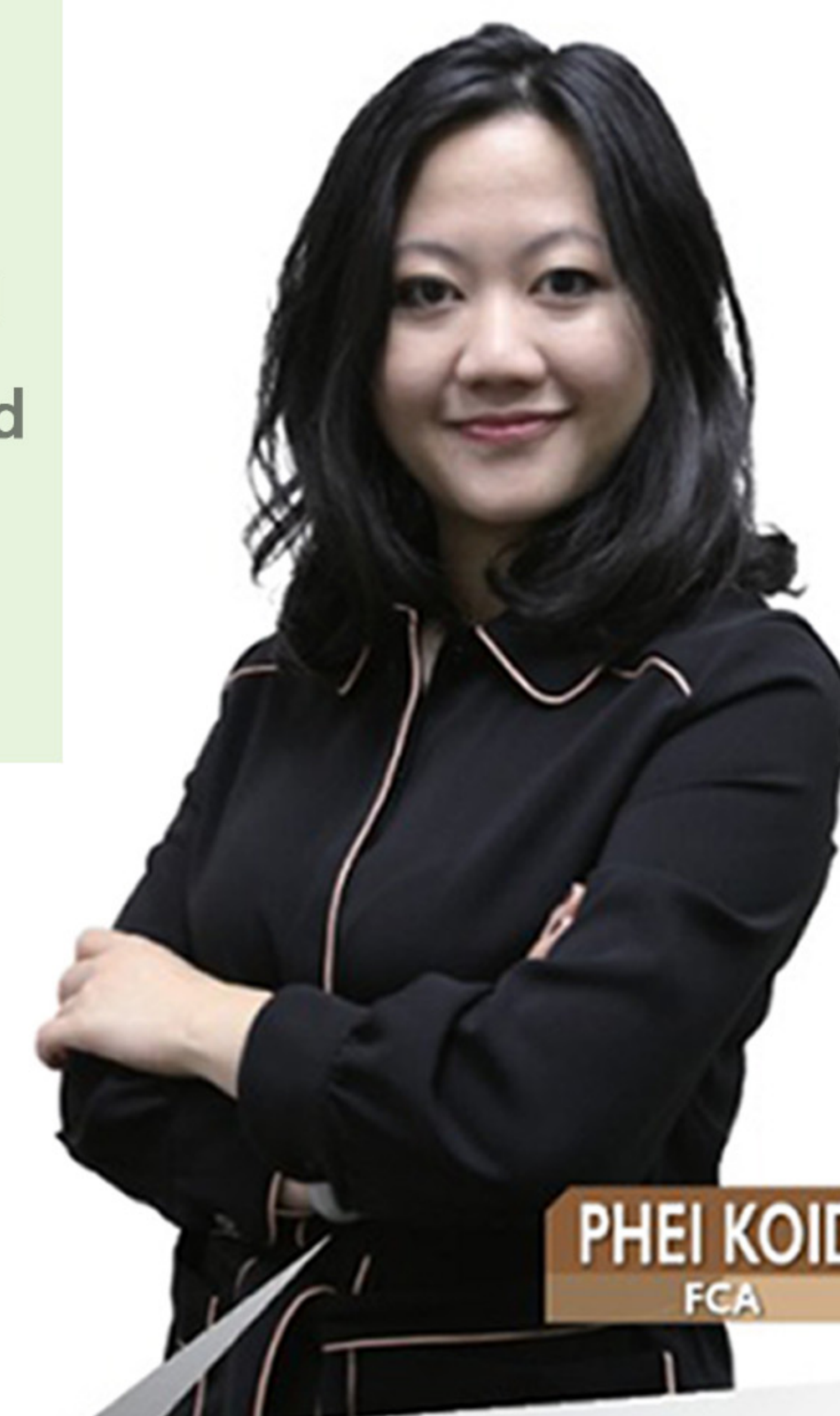
PHEI KOID FCA

3. Make course fee payments and attend class