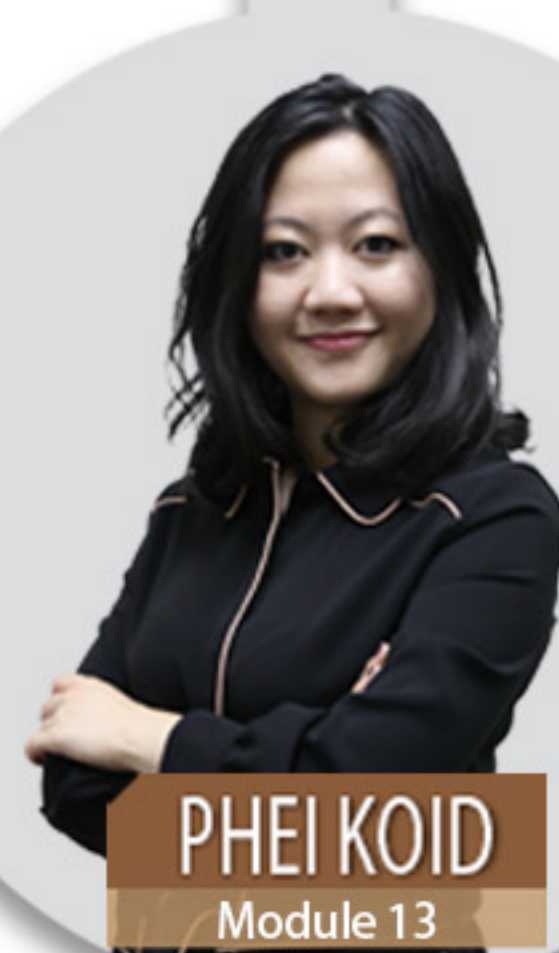
PHEI KOID Module 13